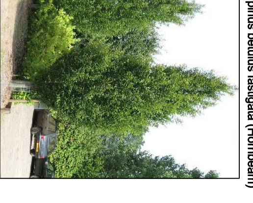
Carpinus betulus fastigiata (Hornbeam)