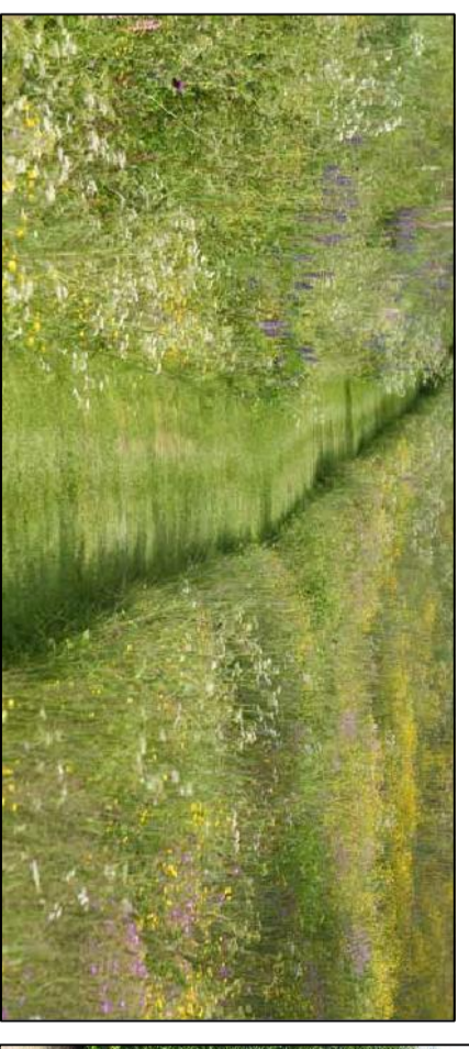
Wildflower Grassland Mix