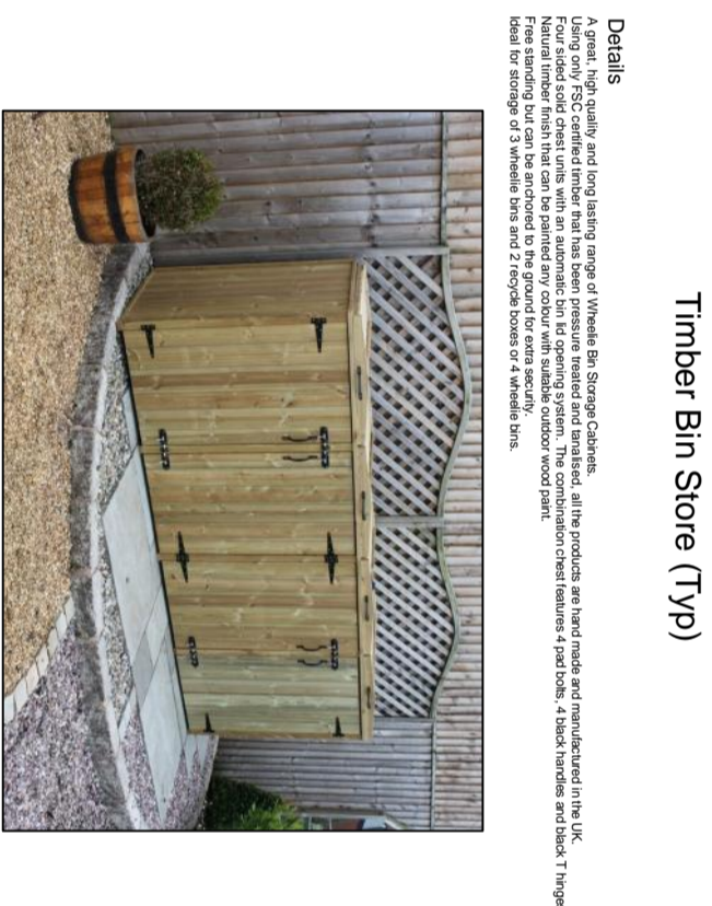
Timber Bin Store (Typ)

Same material as car park - maintenance to be called out by dwelling owner up the adopted highway Walls to screen Plot 6 Garden from Adopted Highway